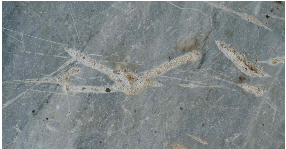
.....the flag with signs.

Next day I was very surprised to see that someone has „ engraved „ a new sign in one of it. I had to cancel the work with them , but I was happy that I safed some sheets to continue the work.